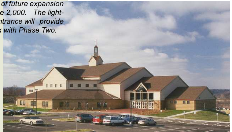
south facade with entry atrium

Phase One of the building program provides a 1,000-seat sanctuary capable of future expansion to accommodate 2,000. The light-filled atrium entrance will provide a dynamic link with Phase Two.