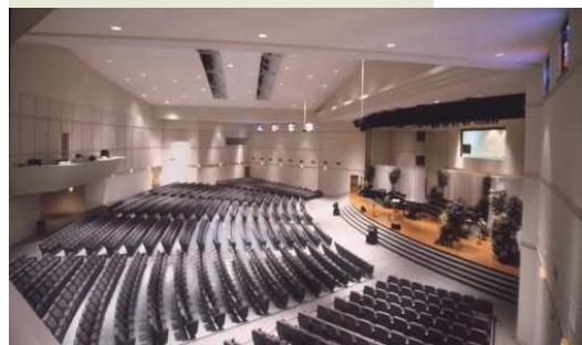
worship center and theatre seating