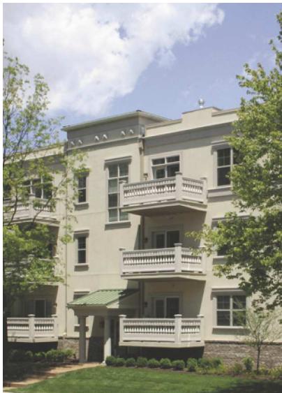
view from street