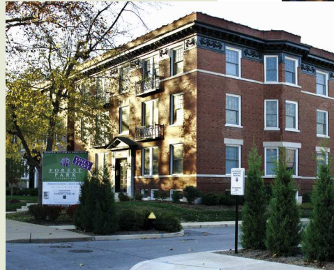
view from south main street