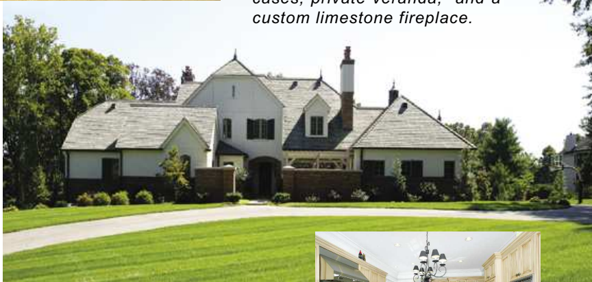
#2 Radnor Place