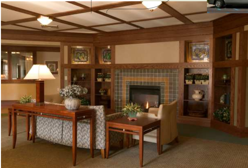
community "hearth" room