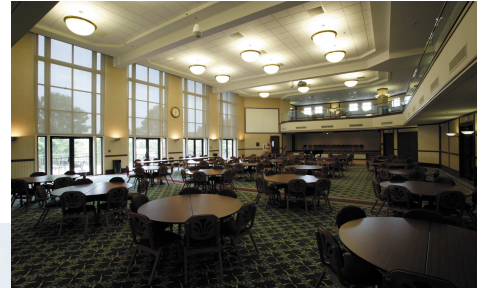
expanded dining room

Expansion of a large retirement community provides new banquet facilities, a fitness center and a chapel in an upscale environment.