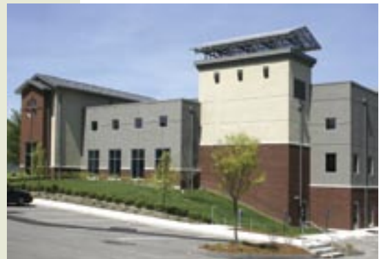
back of the building