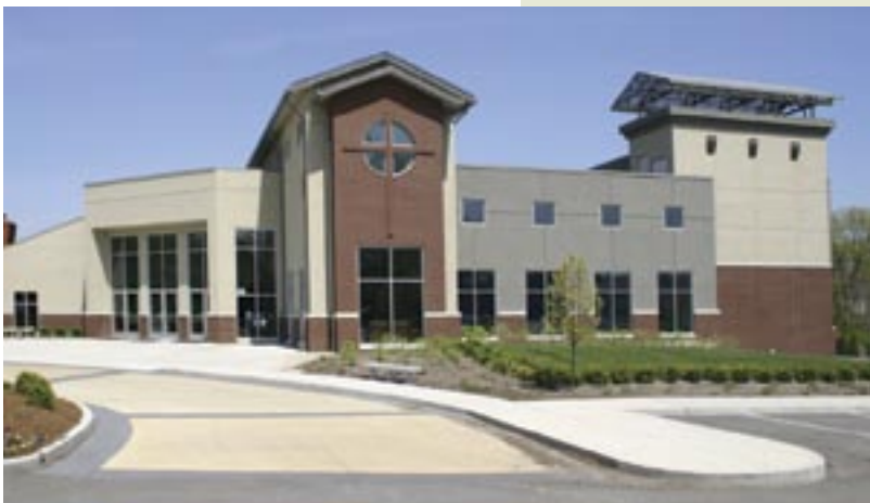
view from Clayton Road

This contemporary expansion of an existing facility creates a dramatic street presence and flexible public spaces surrounding a new sanctuary.