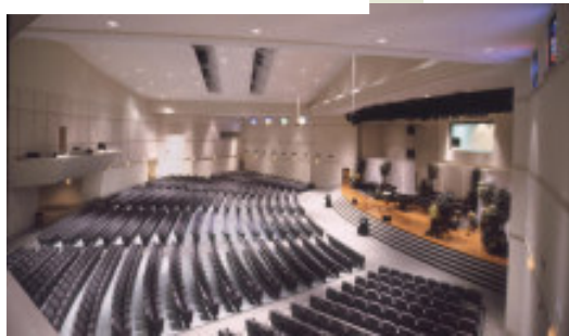
worship center and theatre seating