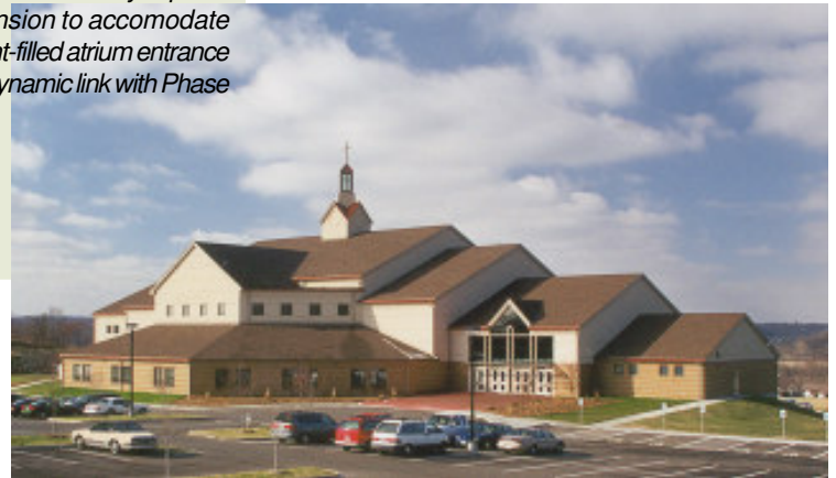
south facade with entry atrium

Phase One of the building program provides a 1,000-seat sanctuary capable of future expansion to accommodate 2,000. The light-filled atrium entrance will provide a dynamic link with Phase Two.