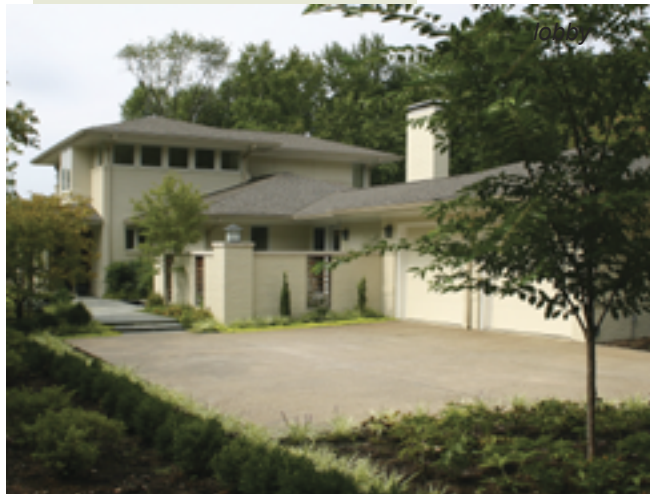
view from Conway Road